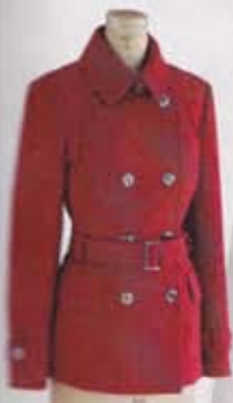
Double-breasted peacoat, Winners, $80.