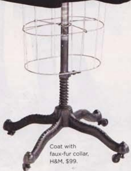
Coat with faux-fur collar, H&M, $99.