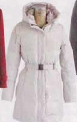
Puffer coat, Joe Fresh, $89.