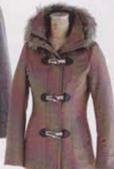
Duffle coat with faux-fur collar, H&M, $99.