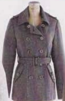
Double-breasted peacoat, George, $60.